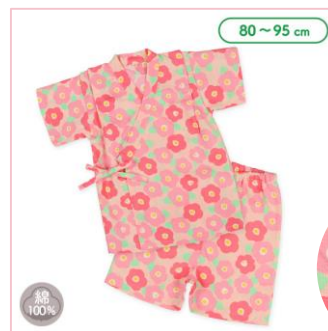
◇Baby Jinbei (Flower Pattern) 80-95cm ¥ 999 ( ¥ 1,098 tax included ) 100% Cotton