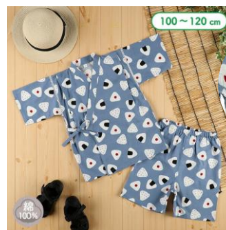
◇Kids Jinbei (Rice Ball Pattern) 100-120cm ¥ 1,299 ( ¥ 1,428 tax included ) 100% Cotton