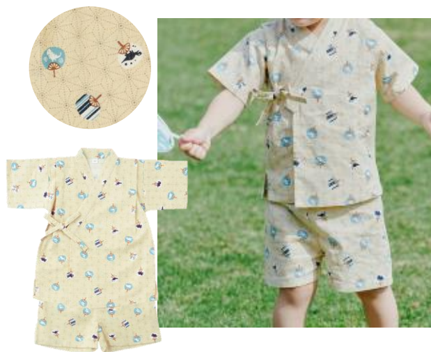
◇Baby Jinbei (Dinosaur/Paper Fan) 80-95cm ¥ 999 ( ¥ 1,098 tax included ) 100% Cotton

JINBEI, traditional Japanese summer clothing, is airy and refreshing to wear even in hot weather.