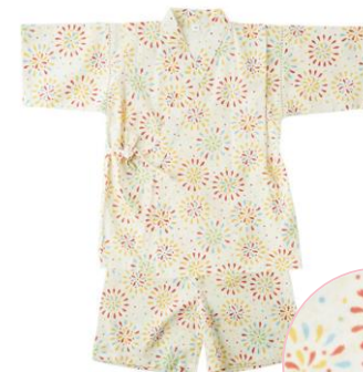
◇Kids Jinbei (Fireworks Pattern) 100~120cm ¥ 1,299 ( ¥ 1,428 tax included ) 100% Cotton