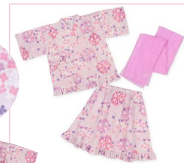
◇Kids Jinbei Dress (with obi · Hydrangea Pattern) 100~130cm ¥1,699 ( ¥1,868 tax included )