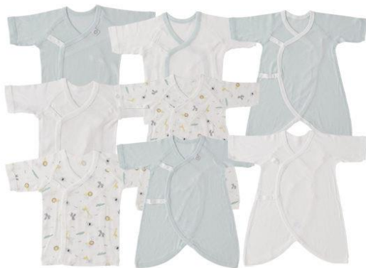
◇Set of 8 Newborn Undershirts 50~60cm ¥ 2,499 ( ¥ 2,748 tax included )

Soft to the touch and gently wraps around the baby's sensitive skin. Designed so that moms and dads can easily put it on their babies. Nishimatsuya offers a wide variety of newborn clothes at affordable prices.